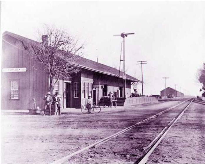
Turlock Train Depot Circa 1910

Article from: Turlock Historical Society Museum